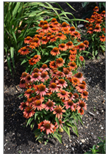
Sombrero Adobe Orange Coneflower in bloom

We are so proud of the nursery stock that we have carefully selected for superior quality and performance, WE GUARANTEE ALL TREES, SHRUBS, EVERGREENS FOR 2 YEARS, AND ROSES FOR 1 YEAR!