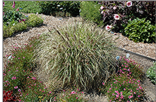
Ginger Love Fountain Grass

Ginger Love Fountain Grass is recommended for the following landscape applications;