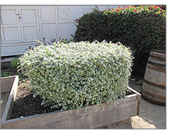
Licorice Plant

Licorice Plant is recommended for the following landscape applications;