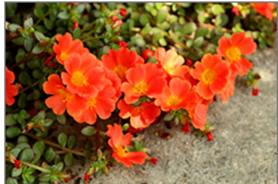
Rio Grande Orange Portulaca flowers

Rio Grande Orange Portulaca is an herbaceous annual with a trailing habit of growth, eventually spilling over the edges of hanging baskets and containers. It brings an extremely fine and delicate texture to the garden composition and should be used to full effect.