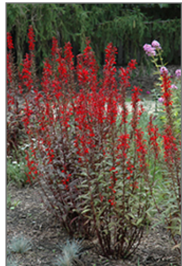
Black Truffle Cardinal Flower in bloom

We are so proud of the nursery stock that we have carefully selected for superior quality and performance, WE GUARANTEE ALL TREES, SHRUBS, EVERGREENS FOR 2 YEARS, AND ROSES FOR 1 YEAR!