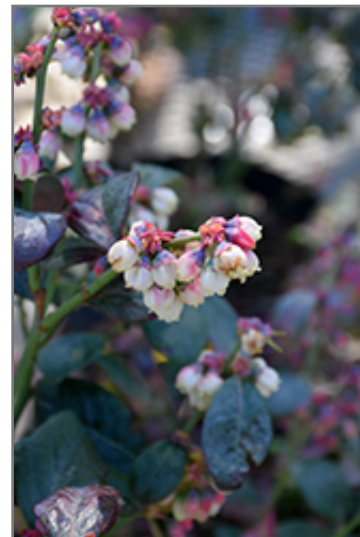
Pink Icing Blueberry flowers

This shrub is quite ornamental as well as edible, and is as much at home in a landscape or flower garden as it is in a designated edibles garden. It does best in full sun to partial shade. It does best in average to evenly moist conditions, but will not tolerate standing water. It is very fussy about its soil conditions and must have sandy, acidic soils to ensure success, and is subject to chlorosis (yellowing) of the foliage in alkaline soils. It is quite intolerant of urban pollution, therefore inner city or urban streetside plantings are best avoided, and will benefit from being planted in a relatively sheltered location. Consider applying a thick mulch around the root zone in winter to protect it in exposed locations or colder microclimates. This particular variety is an interspecific hybrid.