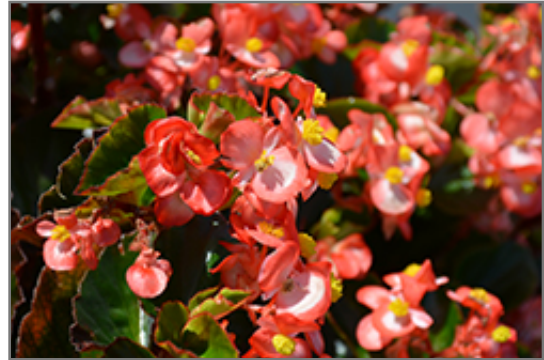
BabyWing Bicolor Begonia flowers

BabyWing Bicolor Begonia is an herbaceous annual with a mounded form. Its medium texture blends into the garden, but can always be balanced by a couple of finer or coarser plants for an effective composition.