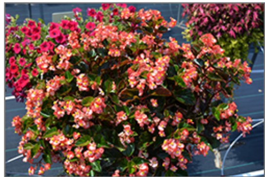
BabyWing Bicolor Begonia in bloom

We are so proud of the nursery stock that we have carefully selected for superior quality and performance, WE GUARANTEE ALL TREES, SHRUBS, EVERGREENS FOR 2 YEARS, AND ROSES FOR 1 YEAR!