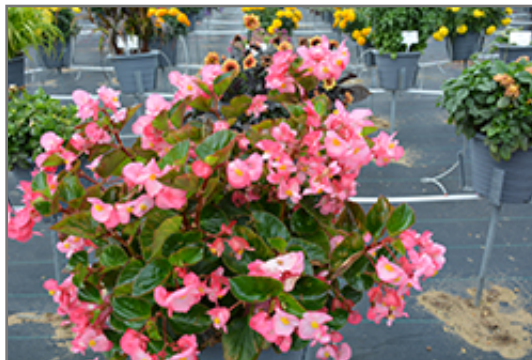
Big Pink Green Leaf Begonia in bloom

Big Pink Green Leaf Begonia is a fine choice for the garden, but it is also a good selection for planting in outdoor containers and hanging baskets. It is often used as a 'filler' in the 'spiller-thriller-filler' container combination, providing a mass of flowers and foliage against which the larger thriller plants stand out. Note that when growing plants in outdoor containers and baskets, they may require more frequent waterings than they would in the yard or garden.