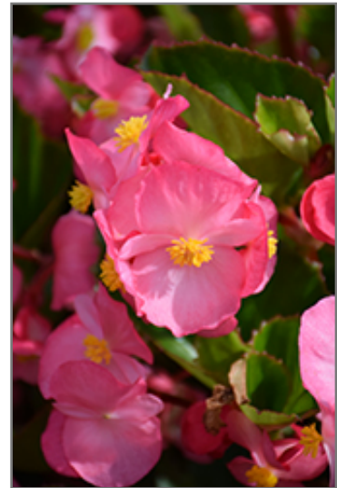
Big Pink Green Leaf Begonia flowers

Big Pink Green Leaf Begonia is an herbaceous annual with an upright spreading habit of growth. Its medium texture blends into the garden, but can always be balanced by a couple of finer or coarser plants for an effective composition.