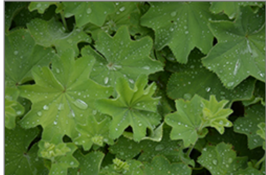
Lady's Mantle foliage

Lady's Mantle will grow to be about 18 inches tall at maturity, with a spread of 18 inches. Its foliage tends to remain dense right to the ground, not requiring facer plants in front. It grows at a medium rate, and under ideal conditions can be expected to live for approximately 10 years. As an herbaceous perennial, this plant will usually die back to the crown each winter, and will regrow from the base each spring. Be careful not to disturb the crown in late winter when it may not be readily seen!