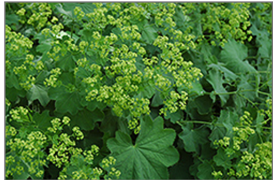
Lady's Mantle flowers

This is a relatively low maintenance plant, and is best cleaned up in early spring before it resumes active growth for the season. Deer don't particularly care for this plant and will usually leave it alone in favor of tastier treats. It has no significant negative characteristics.