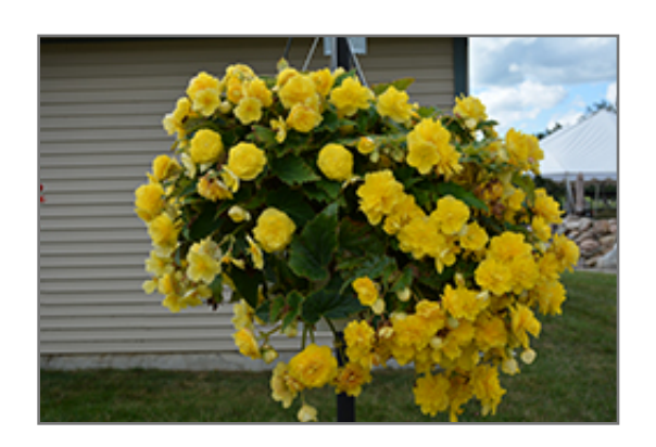
Nonstop Joy Yellow Begonia in bloom

Nonstop Joy Yellow Begonia is recommended for the following landscape applications;