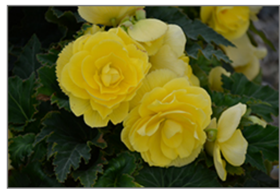
Nonstop Joy Yellow Begonia flowers