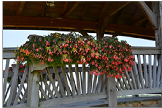
San Francisco Begonia in bloom