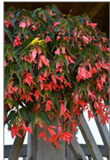
San Francisco Begonia in bloom

We are so proud of the nursery stock that we have carefully selected for superior quality and performance, WE GUARANTEE ALL TREES, SHRUBS, EVERGREENS FOR 2 YEARS, AND ROSES FOR 1 YEAR!