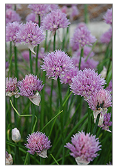
Chives flowers