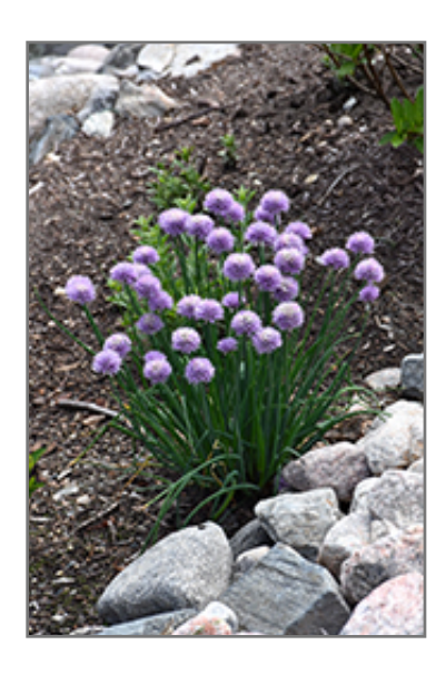
Chives in bloom