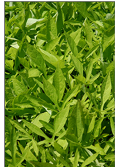
SolarPower Lime Sweet Potato Vine foliage