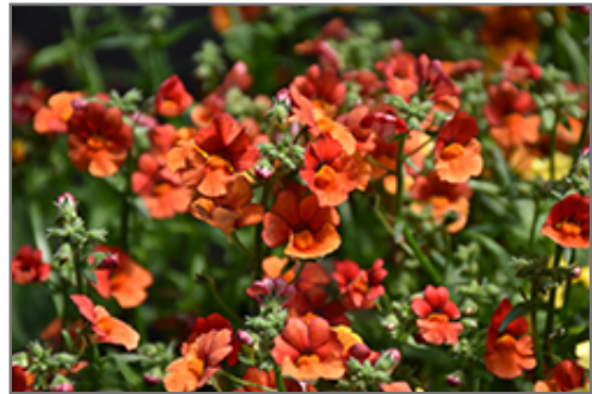
Sunsatia Blood Orange Nemesia flowers

We are so proud of the nursery stock that we have carefully selected for superior quality and performance, WE GUARANTEE ALL TREES, SHRUBS, EVERGREENS FOR 2 YEARS, AND ROSES FOR 1 YEAR!