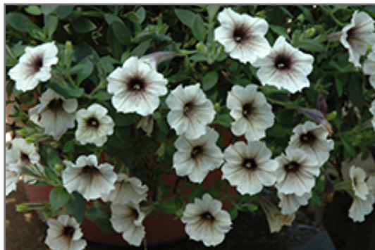
Supertunia Latte Petunia flowers

Supertunia Latte Petunia is recommended for the following landscape applications;