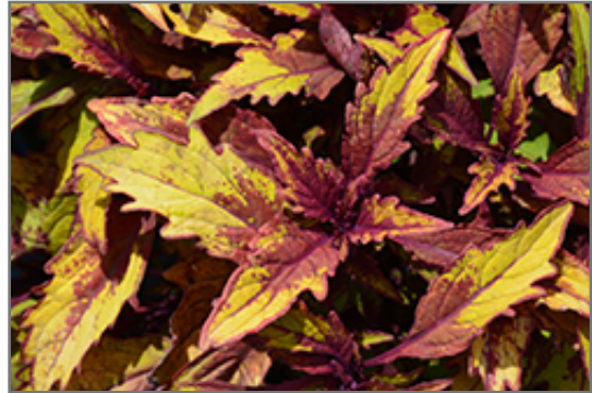
FlameThrower Spiced Curry Coleus foliage

This is a relatively low maintenance plant. The flowers of this plant may actually detract from its ornamental features, so they can be removed as they appear. Deer don't particularly care for this plant and will usually leave it alone in favor of tastier treats. It has no significant negative characteristics.