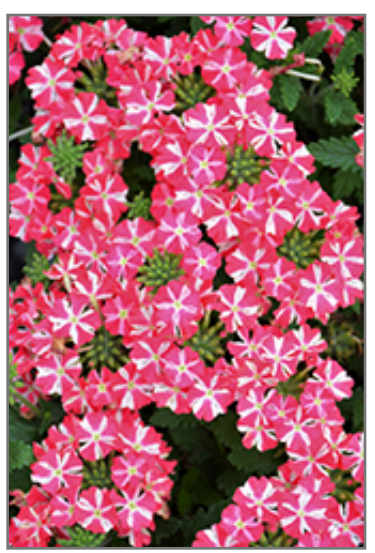
Superbena Royale Cherryburst Verbena flowers

A vigorous selection with a mounding and trailing habit, presenting impressive flower clusters; perfect for the front of beds and as a spiller or filler in combination planters; a continuous bloomer that is heat tolerant