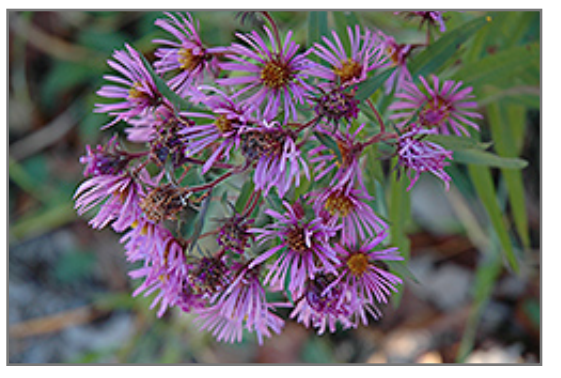
New England Aster flowers

This compact mounded selection is a stunner during the late summer months and into the fall; bubblegum pink flowers with yellow centers bloom among dark green foliage; beautiful in borders or fresh cut arrangements