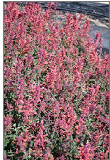
Kudos Coral Hyssop in bloom

We are so proud of the nursery stock that we have carefully selected for superior quality and performance, WE GUARANTEE ALL TREES, SHRUBS, EVERGREENS FOR 2 YEARS, AND ROSES FOR 1 YEAR!