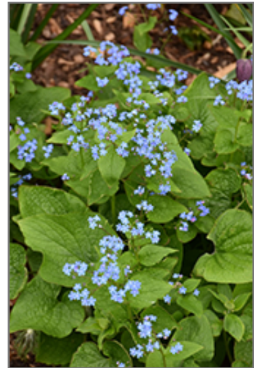
Siberian Bugloss flowers

Siberian Bugloss is recommended for the following landscape applications;