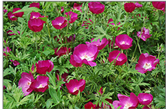
Buffalo Poppy flowers