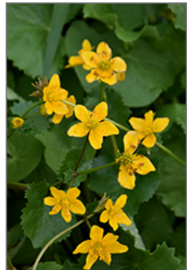
Marsh Marigold flowers

We are so proud of the nursery stock that we have carefully selected for superior quality and performance, WE GUARANTEE ALL TREES, SHRUBS, EVERGREENS FOR 2 YEARS, AND ROSES FOR 1 YEAR!