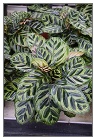
Peacock Plant in full

We are so proud of the nursery stock that we have carefully selected for superior quality and performance, WE GUARANTEE ALL TREES, SHRUBS, EVERGREENS FOR 2 YEARS, AND ROSES FOR 1 YEAR!