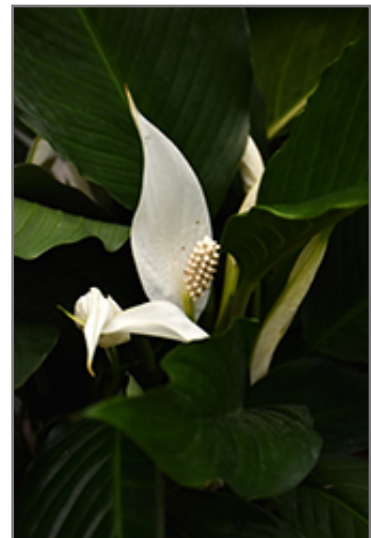
Peace Lily flowers

We are so proud of the nursery stock that we have carefully selected for superior quality and performance, WE GUARANTEE ALL TREES, SHRUBS, EVERGREENS FOR 2 YEARS, AND ROSES FOR 1 YEAR!