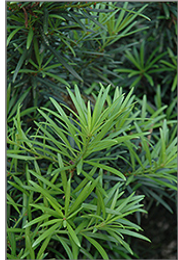
Japanese Yew foliage

This is a multi-stemmed evergreen houseplant with a narrowly upright and columnar growth habit. Its relatively fine texture sets it apart from other indoor plants with less refined foliage. This plant can be pruned at any time to keep it looking its best.