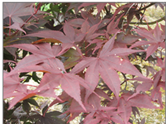
Red Emperor Japanese Maple foliage

We are so proud of the nursery stock that we have carefully selected for superior quality and performance, WE GUARANTEE ALL TREES, SHRUBS, EVERGREENS FOR 2 YEARS, AND ROSES FOR 1 YEAR!