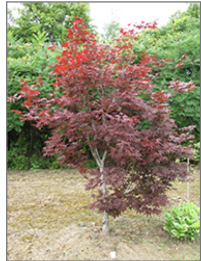
Red Emperor Japanese Maple

Red Emperor Japanese Maple is a deciduous tree with an upright spreading habit of growth. Its average texture blends into the landscape, but can be balanced by one or two finer or coarser trees or shrubs for an effective composition.