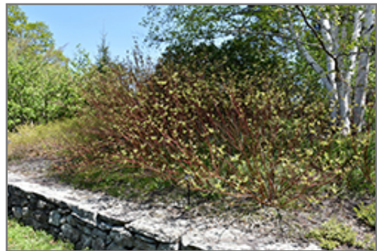
Bailey's Red Twig Dogwood in spring

We are so proud of the nursery stock that we have carefully selected for superior quality and performance, WE GUARANTEE ALL TREES, SHRUBS, EVERGREENS FOR 2 YEARS, AND ROSES FOR 1 YEAR!