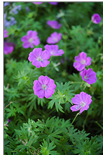
Alpenglow Cranesbill flowers

This is a relatively low maintenance plant, and should only be pruned after flowering to avoid removing any of the current season's flowers. It is a good choice for attracting butterflies to your yard, but is not particularly attractive to deer who tend to leave it alone in favor of tastier treats. It has no significant negative characteristics.