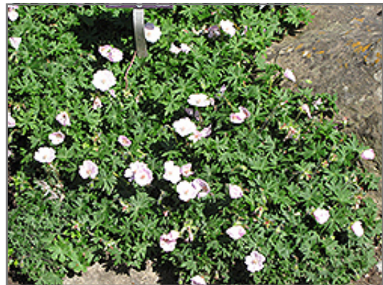
Striated Cranesbill in bloom

We are so proud of the nursery stock that we have carefully selected for superior quality and performance, WE GUARANTEE ALL TREES, SHRUBS, EVERGREENS FOR 2 YEARS, AND ROSES FOR 1 YEAR!