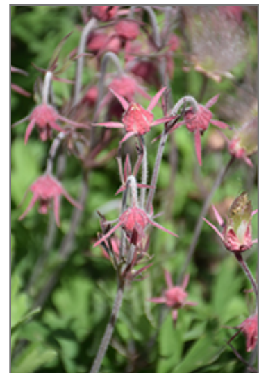
Prairie Smoke flower buds

We are so proud of the nursery stock that we have carefully selected for superior quality and performance, WE GUARANTEE ALL TREES, SHRUBS, EVERGREENS FOR 2 YEARS, AND ROSES FOR 1 YEAR!