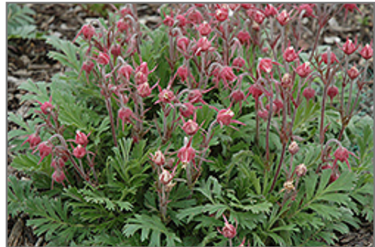
Prairie Smoke in bloom

Prairie Smoke is an herbaceous perennial with an upright spreading habit of growth. Its relatively fine texture sets it apart from other garden plants with less refined foliage.