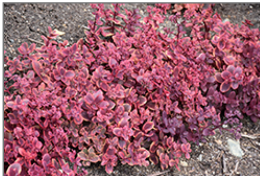
Sunsparkler Wildfire Stonecrop