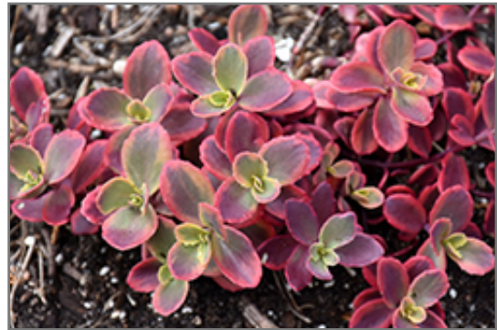
Sunsparkler Wildfire Stonecrop foliage

We are so proud of the nursery stock that we have carefully selected for superior quality and performance, WE GUARANTEE ALL TREES, SHRUBS, EVERGREENS FOR 2 YEARS, AND ROSES FOR 1 YEAR!