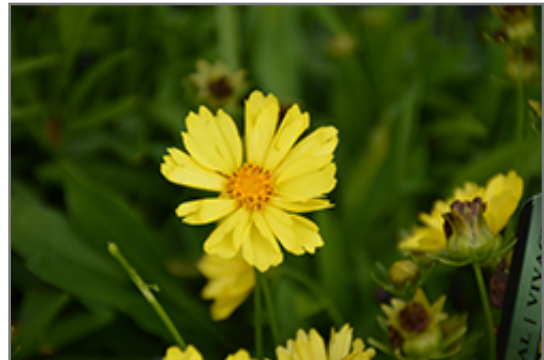
Leading Lady Sophia Tickseed flowers

This is a relatively low maintenance plant, and is best cleaned up in early spring before it resumes active growth for the season. It is a good choice for attracting butterflies to your yard, but is not particularly attractive to deer who tend to leave it alone in favor of tastier treats. It has no significant negative characteristics.