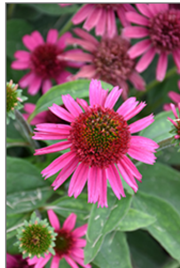
Delicious Candy Coneflower flowers

Delicious Candy Coneflower is an herbaceous perennial with an upright spreading habit of growth. Its medium texture blends into the garden, but can always be balanced by a couple of finer or coarser plants for an effective composition.