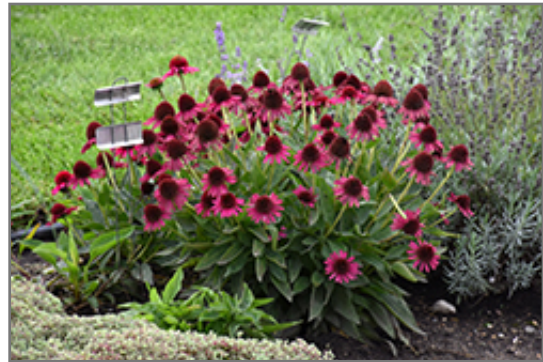
Delicious Candy Coneflower in bloom