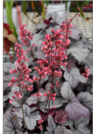
Dolce Silver Gumdrop Coral Bells flowers

Dolce Silver Gumdrop Coral Bells is a dense herbaceous evergreen perennial with tall flower stalks held atop a low mound of foliage. Its relatively fine texture sets it apart from other garden plants with less refined foliage.