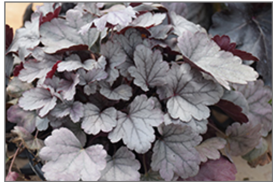
Dolce Silver Gumdrop Coral Bells foliage

We are so proud of the nursery stock that we have carefully selected for superior quality and performance, WE GUARANTEE ALL TREES, SHRUBS, EVERGREENS FOR 2 YEARS, AND ROSES FOR 1 YEAR!