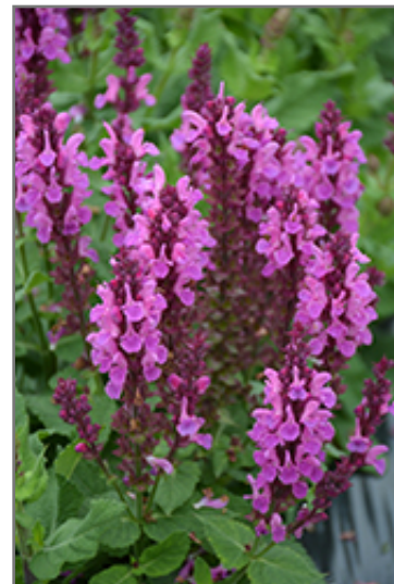
Rose Marvel Meadow Sage flowers

Rose Marvel Meadow Sage is an herbaceous perennial with an upright spreading habit of growth. Its relatively fine texture sets it apart from other garden plants with less refined foliage.