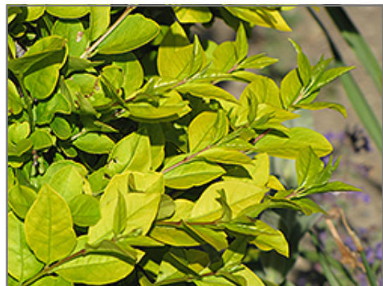
Golden Privet foliage

We are so proud of the nursery stock that we have carefully selected for superior quality and performance, WE GUARANTEE ALL TREES, SHRUBS, EVERGREENS FOR 2 YEARS, AND ROSES FOR 1 YEAR!