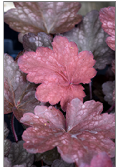
Carnival Candy Apple Coral Bells foliage

We are so proud of the nursery stock that we have carefully selected for superior quality and performance, WE GUARANTEE ALL TREES, SHRUBS, EVERGREENS FOR 2 YEARS, AND ROSES FOR 1 YEAR!