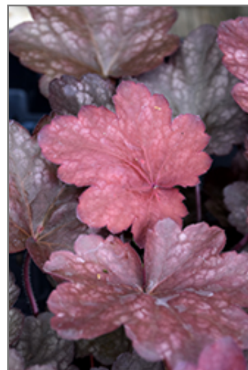
Carnival Candy Apple Coral Bells foliage

We are so proud of the nursery stock that we have carefully selected for superior quality and performance, WE GUARANTEE ALL TREES, SHRUBS, EVERGREENS FOR 2 YEARS, AND ROSES FOR 1 YEAR!