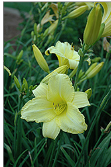
Happy Ever Appster Happy Returns Daylily flowers

Happy Ever Appster Happy Returns Daylily is an herbaceous perennial with a shapely form and gracefully arching foliage. It brings an extremely fine and delicate texture to the garden composition and should be used to full effect.