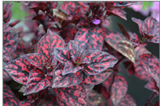
Hippo Red Polka Dot Plant foliage

Hippo Red Polka Dot Plant is recommended for the following landscape applications;