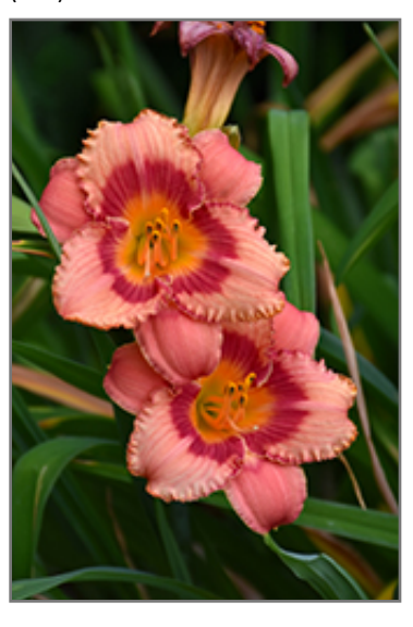
Strawberry Candy Daylily flowers