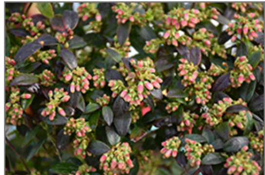
Blueberry Glaze Blueberry flowers

Blueberry Glaze Blueberry features dainty clusters of white bell-shaped flowers hanging below the branches in mid spring, which emerge from distinctive rose flower buds. It has dark green deciduous foliage. The glossy oval leaves turn outstanding shades of yellow, red and deep purple in the fall. It features an abundance of magnificent navy blue berries in mid summer.