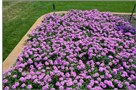
EnduraScape Pink Bicolor Verbena in bloom