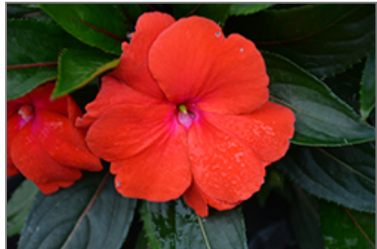
Magnum Red Flame New Guinea Impatiens flowers

Magnum Red Flame New Guinea Impatiens is recommended for the following landscape applications;