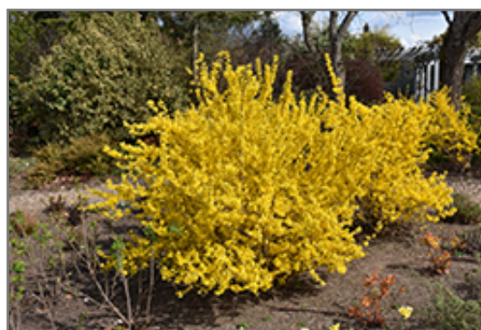
Magical Gold Forsythia in bloom

We are so proud of the nursery stock that we have carefully selected for superior quality and performance, WE GUARANTEE ALL TREES, SHRUBS, EVERGREENS FOR 2 YEARS, AND ROSES FOR 1 YEAR!