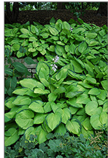
Gold Standard Hosta in bloom

We are so proud of the nursery stock that we have carefully selected for superior quality and performance, WE GUARANTEE ALL TREES, SHRUBS, EVERGREENS FOR 2 YEARS, AND ROSES FOR 1 YEAR!