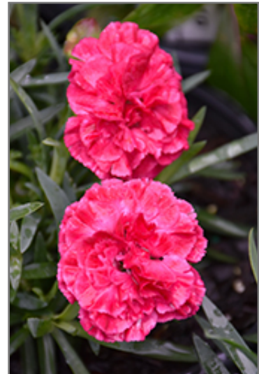
Fruit Punch Raspberry Ruffles Pinks flowers

We are so proud of the nursery stock that we have carefully selected for superior quality and performance, WE GUARANTEE ALL TREES, SHRUBS, EVERGREENS FOR 2 YEARS, AND ROSES FOR 1 YEAR!