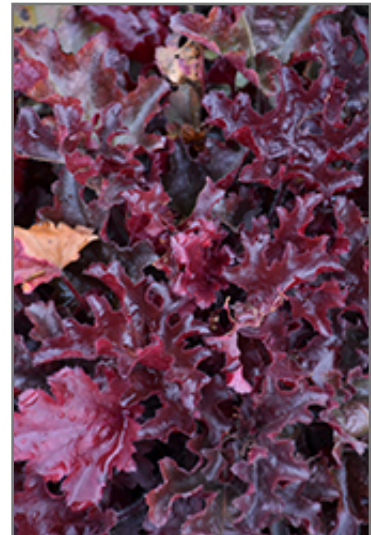
Dolce Cherry Truffles Coral Bells foliage

We are so proud of the nursery stock that we have carefully selected for superior quality and performance, WE GUARANTEE ALL TREES, SHRUBS, EVERGREENS FOR 2 YEARS, AND ROSES FOR 1 YEAR!