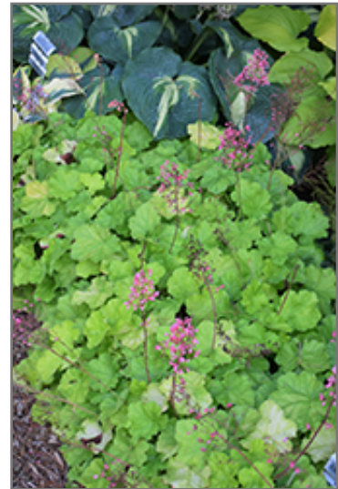
Primo Pretty Pistachio Coral Bells in bloom

Primo Pretty Pistachio Coral Bells is a dense herbaceous evergreen perennial with tall flower stalks held atop a low mound of foliage. Its relatively fine texture sets it apart from other garden plants with less refined foliage.