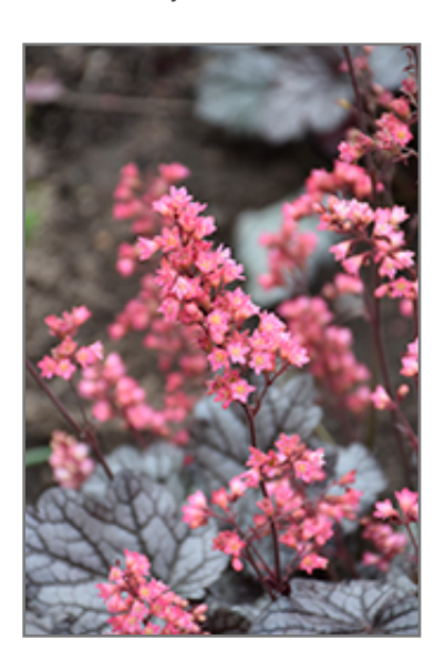
Timeless Treasure Coral Bells flowers