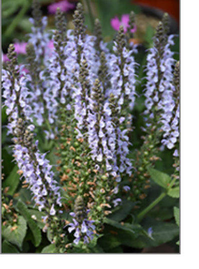
Bumblesky Meadow Sage flowers

Bumblesky Meadow Sage is an herbaceous perennial with an upright spreading habit of growth. Its relatively fine texture sets it apart from other garden plants with less refined foliage.