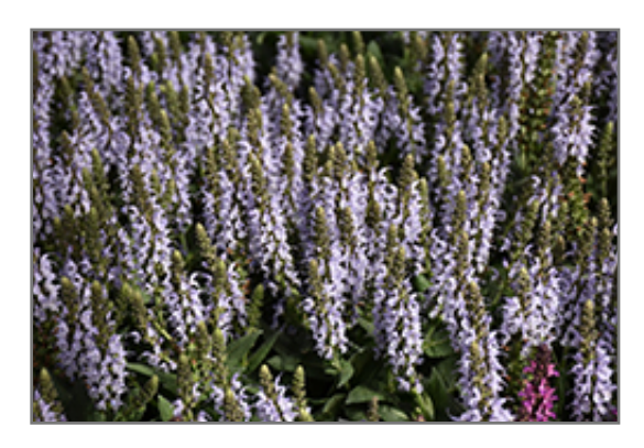
Bumblesky Meadow Sage flowers