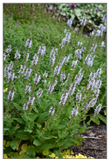
Bumblesky Meadow Sage in bloom

This plant should only be grown in full sunlight. It is very adaptable to both dry and moist locations, and should do just fine under typical garden conditions. It is not particular as to soil type or pH. It is somewhat tolerant of urban pollution. This is a selected variety of a species not originally from North America. It can be propagated by division; however, as a cultivated variety, be aware that it may be subject to certain restrictions or prohibitions on propagation.